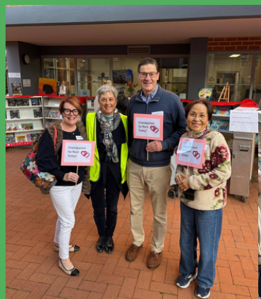
Parishioners who stood in as an honorary grandparent for some of the children.