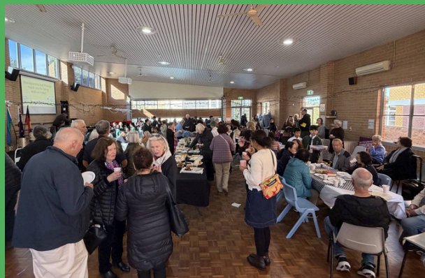
Above: morning tea in MacKillop Hall following the special School Mass.